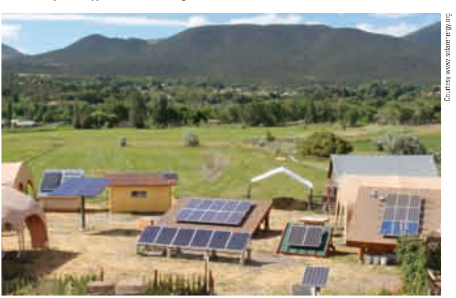
Some RE training centers offer students hands-on opportunities to work on many different system types and mounting structures.